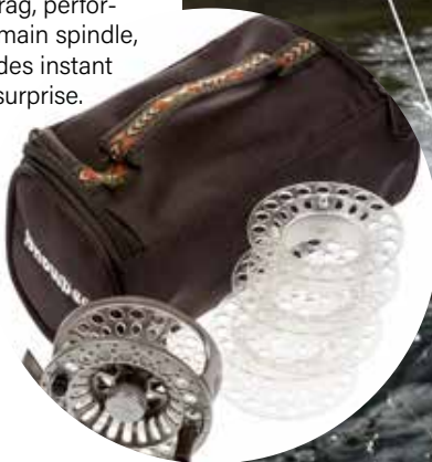
10549CS-3 Spectre Cassette Fly Reel Kit #5/6