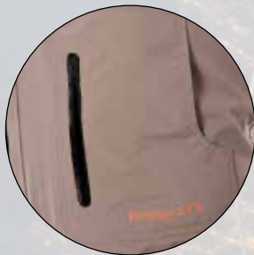
YKK Aquaguard® Zippers