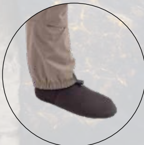
4mm Neoprene Socks