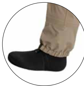
4mm Neoprene Socks