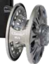
10561G-KIT Classic 2 Cassette Kit #5/6