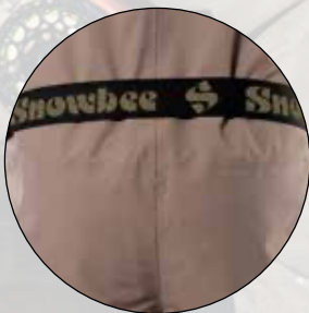
Included Wading Belt + Seat Pad

Available In Sizes: S, M, MS, ML, L, LS, LL, XL, XLS, XXL, MK, LK, XLK