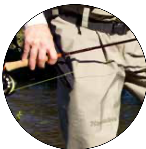
Included Wading Belt

Available In Sizes: S, M, L, XL, XXL, M-FB, L-FB, XL-FB