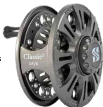
10560G Classic 2 #5/6