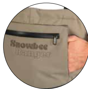
YKK Aquaguard ® Zippers